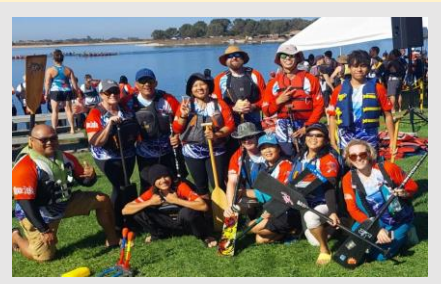
San Diego Dragon Boat Festival Saturday, 10/19 / 24 First race / Time trials: 2nd Place Semi finals: 1:19.777 1st Place Finals: 1:22.805 1st Place